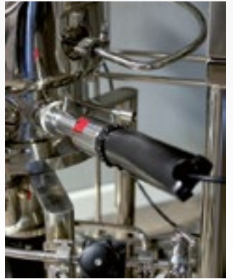
Hamilton RetractoFit Bio 25