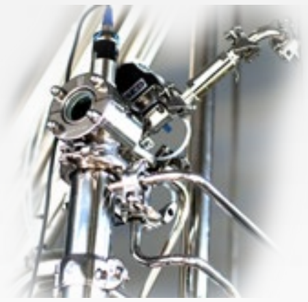
Automatic mechanical seal lubrication with steam condensate loop