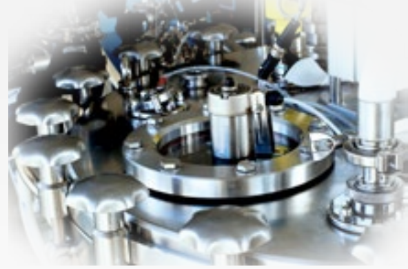
Top view with illuminated side glass