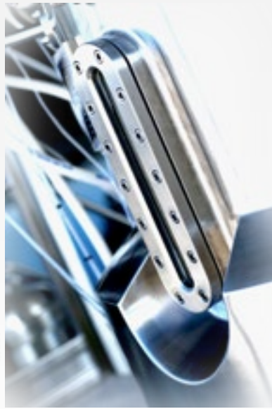
Front view side glass